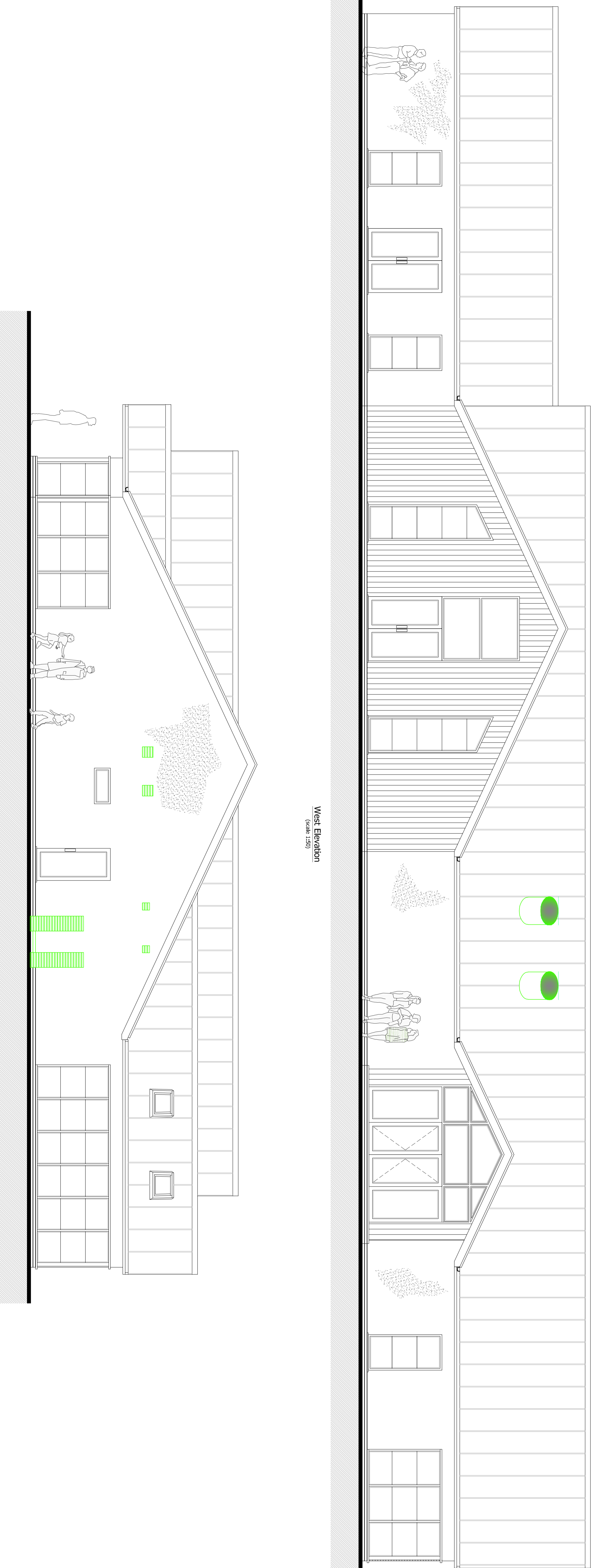
West Elevation (Scale: 1:50)