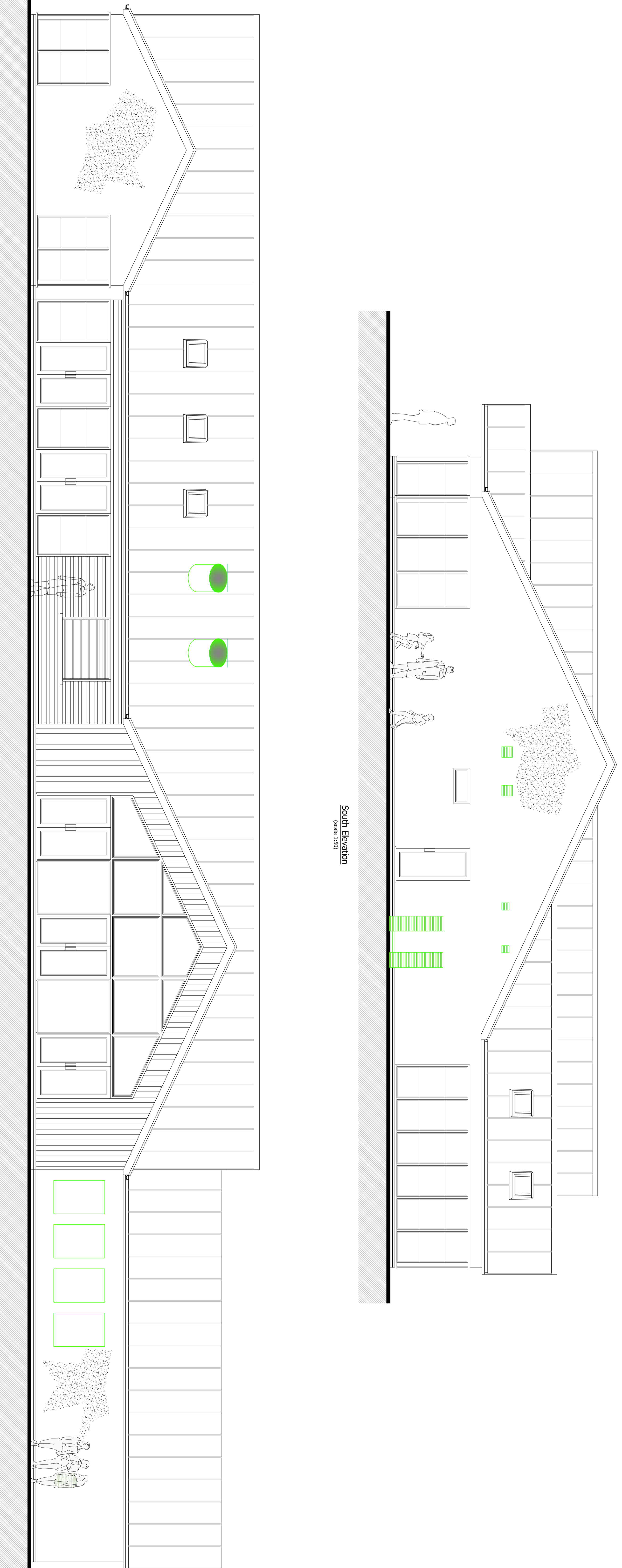
South Elevation (Scale: 1:50)